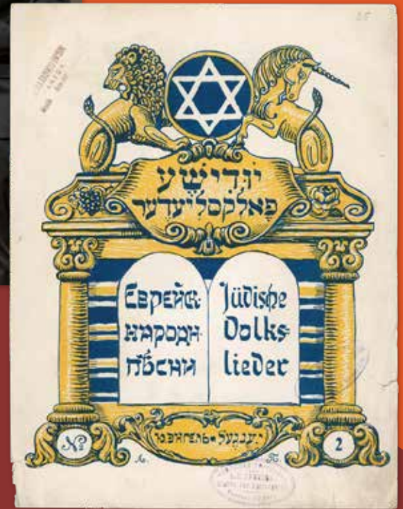
BELOW: Sheet music for Joel Engel's Jewish Folksongs with art by Leonid Pasternak, 1909.